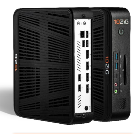
6110 Hardware Specs Here

As a provider of PCoIP® VDI endpoint solutions and a longstanding Teradici Partner, 10ZiG supports Teradici CAS deployments with Windows PCoIP Thin Client endpoint devices. The PCoIP Software Client installed on 10ZiG Thin Clients provides access to any Teradici CAS deployment on-premises, or in the Cloud, and to Amazon WorkSpaces. The 10ZiG Thin Client, Windows 10 IoT 6110, is a perfect fit for the graphics-intensive workloads and PCoIP Ultra performance enhancements. This power-user endpoint supports high-demand workers with support for up to four monitors and 4K/UHD resolution, and it is centrally managed with the always-free, Cloud-enabled - The 10ZiG Manager™. The AMD Ryzen Embedded V1202B Core 6110 Endpoint also offers up to 32 GB DDR4 RAM and up to 8 USB ports including USB 3.0, as well as a Fiber option. Engineers, designers, and any high graphic and video demand environment will benefit from its Cloud-based performance, including media and entertainment, healthcare, financial services, and government.